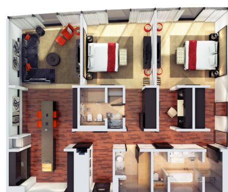
Wonderful Area 143 SQM