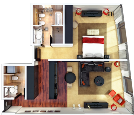
Warm Area 73 SQM