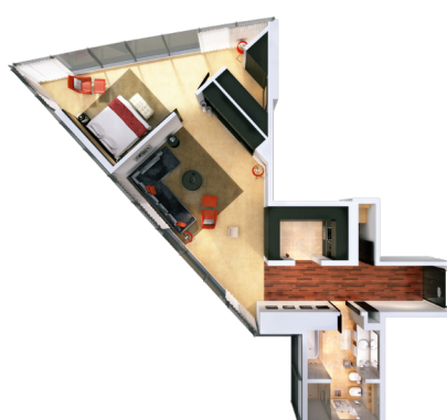
Witty Area 107 SQM