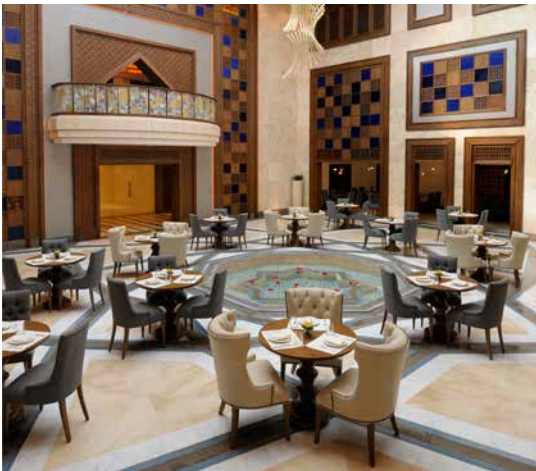
LA PIAZZA RESTAURANT

La Patisserie: offers a wide variety of homemade French delicacies and bakery items by our patisserie chef. Discover international favourites, selection of shisha and live music as you witness the vibrant Souq Waqif.