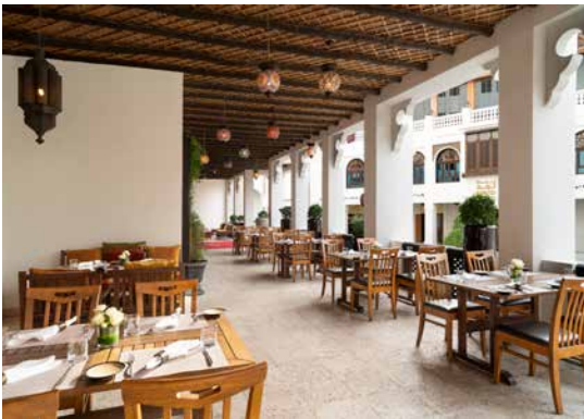
AL TERRACE RESTAURANT

Al Terrace: Our Lebanese restaurant Al Terrace combines your choice of comfortable indoor seating and an al fresco veranda offering fragrant shishas and live music from local talents. Come by to indulge in authentic delights and a medley of mouthwatering Arabic desserts.