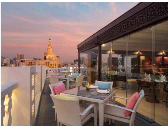
AL SHURFA ARABIC LOUNGE

Al Shurfa: the perfect location for relaxed dining atmosphere with friends, taking in the sights and sounds of the bustling Souq below and looking out across the city's waterfront. Guest can enjoy authentic Arabic dishes and special signature shisha flavour are available to choose from.