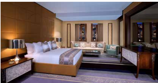
AMIRI SUITE BEDROOM