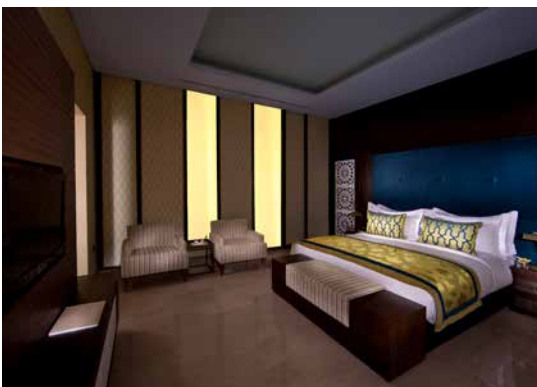
DELUXE SUITE - BEDROOM